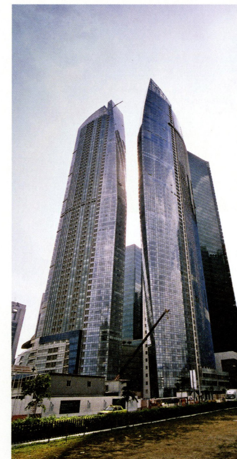
The Sail at Marina Bay, as seen from the Central Promontory; Changi Airport Terminal 3; Orchard Suites

Seogwipo-si, Republic of South Korea Architect: Samoo Architects & Engineers Club House Design Architect: Mario Botta Architettura Developer: Bokwang Jeju Co., Ltd.